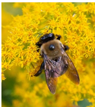
A pollinator at work.