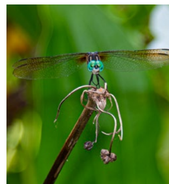
Into the eyes of a dragonfly.