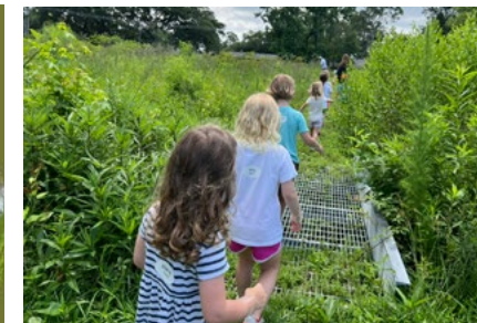
Campers exploring the meadow.