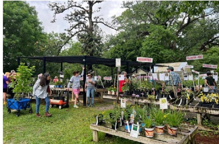
Shoppers enjoying Spring Fling in 2024.

Celebrating decades of masterfully connecting people and plants in the unique, natural space that is the LSU Hilltop Arboretum, this year's Spring Fling will offer an expanded selection of native plants for sale along with native plant resources and education. Over 300 species of native and traditional trees, shrubs, perennials, vines, ferns, camellias, and grasses, all sourced from trusted nurseries in the south, will be available for purchase. Hilltop "plant experts" will be on hand to assist with your plant selections and offer landscaping advice.