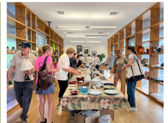
Spring Fling Yarden shoppers in the Hilltop Arboretum library.

All Yarden proceeds directly benefit Hilltop.