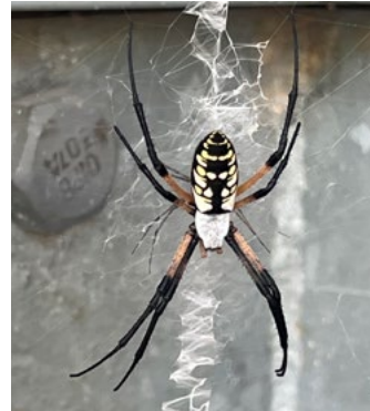
A banana spider rests on its web.