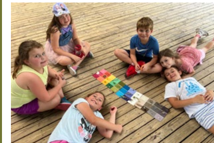
Campers learning the nature color wheel.