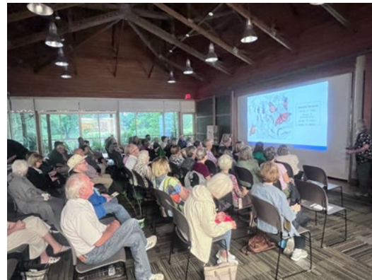
Guests enjoy a talk on "Monarchs and Migration".