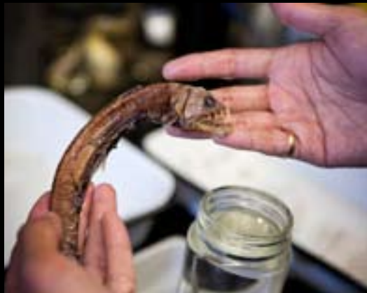
A specimen from the museum’s ichthyology collection.

“We want to teach people about their own native fishes. We collect with locals, so we want to bring some students back to learn microscopy, molecular work, and other complex skills, to add value to the education they already have,” said Chakrabarty . “You can’t recognize diversity without being familiar with your own.”