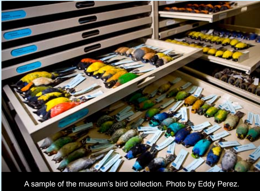
A sample of the museum’s bird collection.