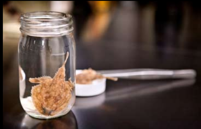
Another specimen from the ichthyology collection.