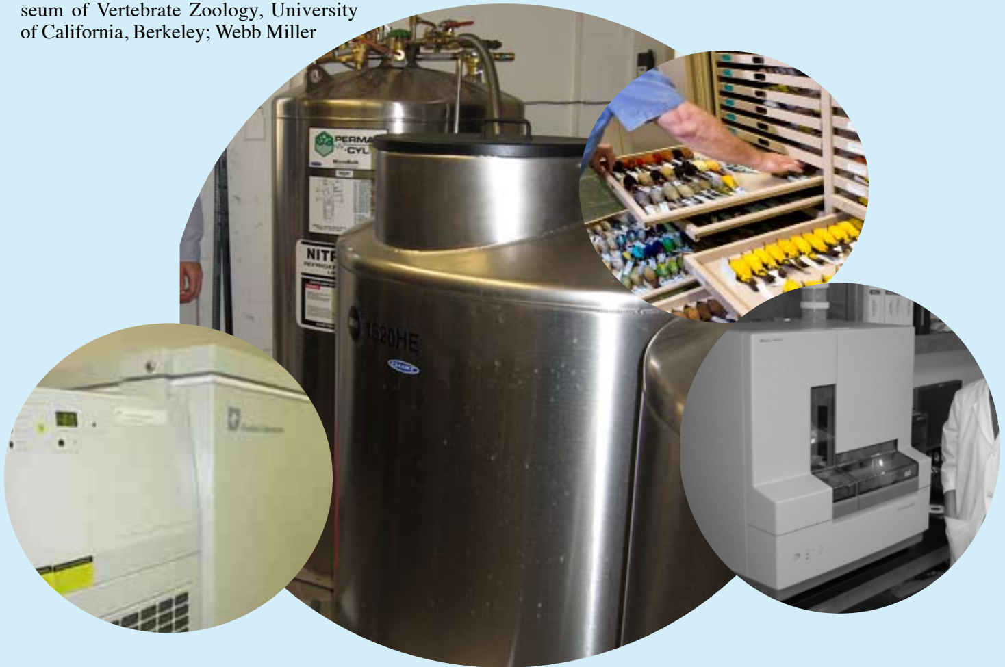
Museum's collection of genetic resources, largest of its kind, expected to provide approximately half of the specimens for project.

For more information about the Genome 10K project, visit http://genome10k.soe.ucsc.edu/ .