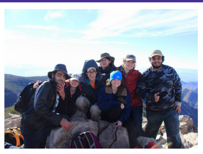
DECEMBER: Members of the LSU Geology Club pose during a field trip to Big Bend National Park.