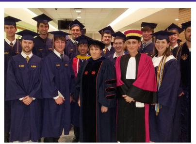
DECEMBER: Students eagerly awaiting to walk across the stage and receive their diplomas at the LSU College of Science Fall Commencement ceremony.